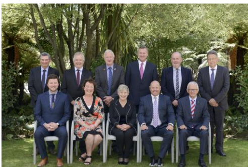
Canterbury Mayoral Forum

Have a chat to your Mayor or Chief Executive