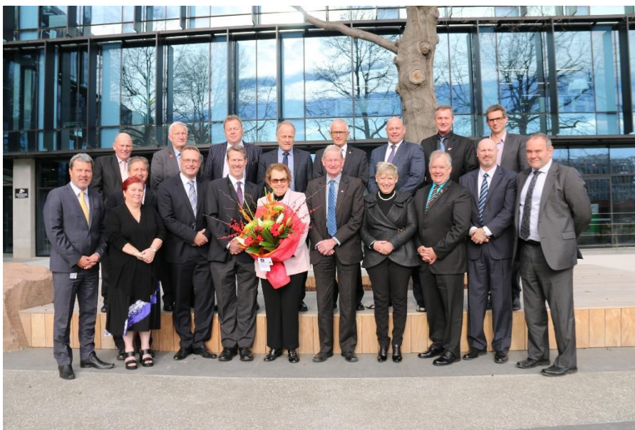
Canterbury Mayoral Forum 2013–16 (Mayors/Chair and Chief Executives), 24 June 2016